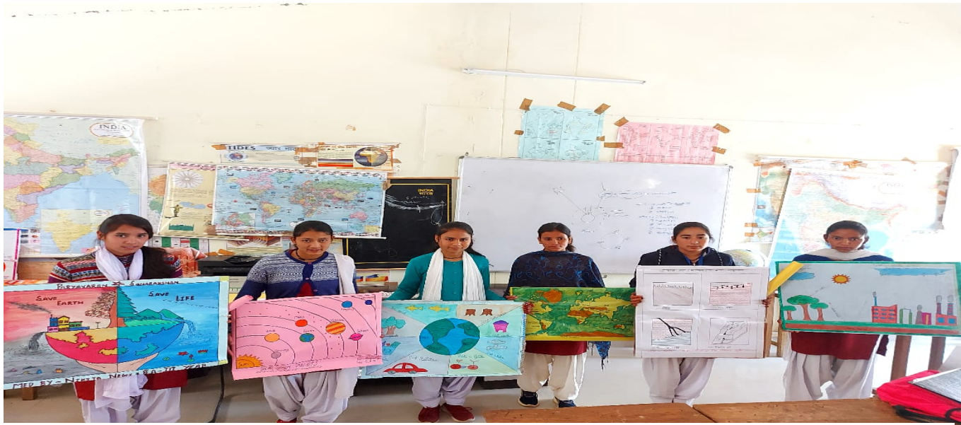
Figure 1 Model/Project Making Compition

Our Mission is to lead the development of educational, academic and research direction of human and natural systems, Rural, Himalayan and Environmental Problems, harnessing the integrative nature of Geography science to answer fundamental question of global importance.