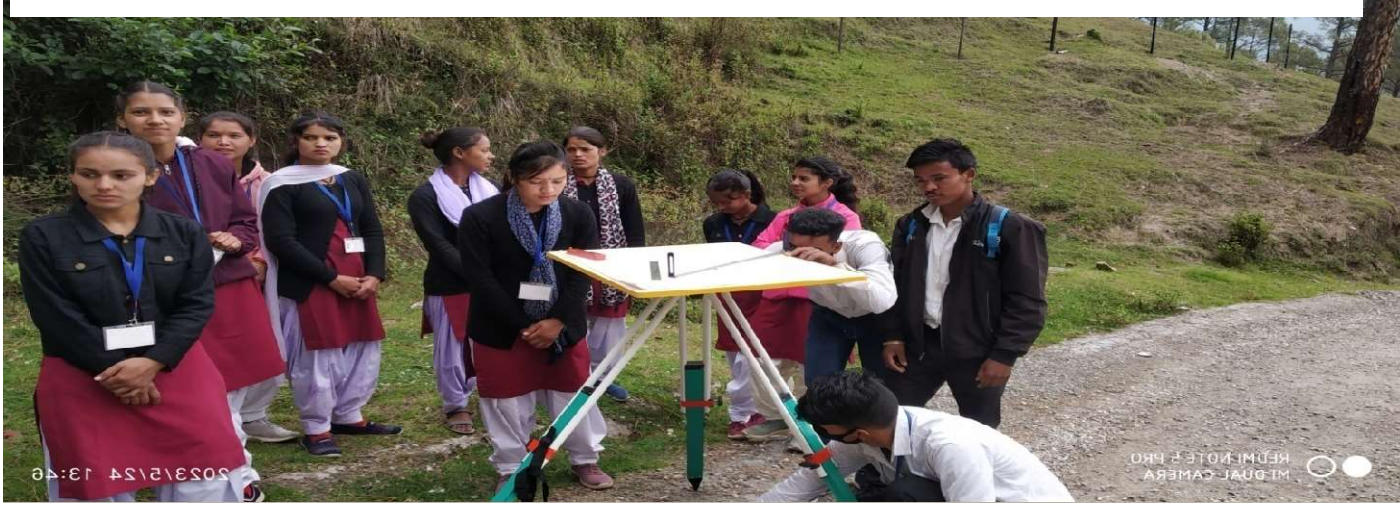
Figure 2 Plane Table Survey